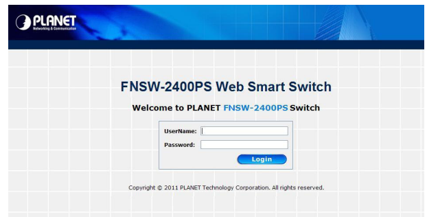
Figure 4-1. Web Login Screen of FNSW-2400PS

Default IP Address: 192.168.0.100 Default User Name: admin Default Password: admin