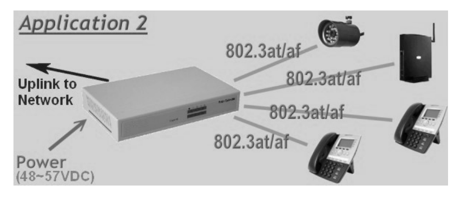
In Application -2, the switch cannot receive power from uplink port. A local power connection is provided for PoE application.

The switch can deliver both power and data to PoE PD devices, e.g. some IP cameras, IP phones, and WiFi APs. That will reduce the construction cost for those applications, and make them become easy to implement. The switch can auto-detect the connecting devices and decide to send power or not. Only when correct PoE PD is connected, power will be delivered on the cable. For non-PoE devices, only data will be delivered - working like a normal Ethernet switch. If power overload happens, power delivering will be stop automatically for safety. No any configuration is needed - just plug-and-play.